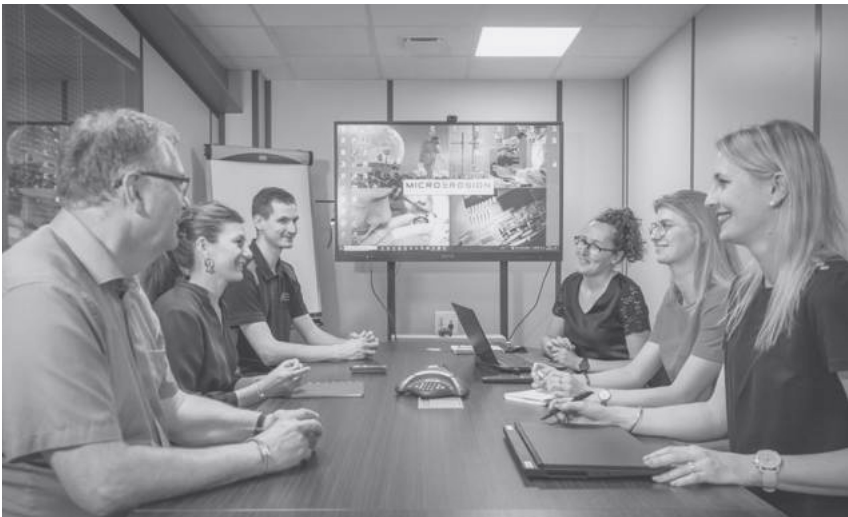
A multidisciplinary team which promotes strong dynamism within the company